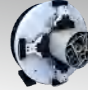
Flexible matching of various tube types