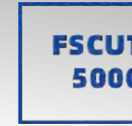
Digital bus control system